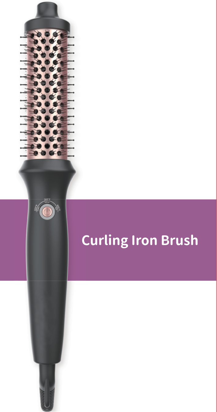
Curling Iron Brush

When using electrical appliances, especially when children are present, basic safety precautions should always be followed, including the following: